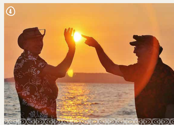
IMAGES 1 Twin Falls, King George River | 2 Brown Booby with chick | 3 Zodiac on the King George River | 4 Sunset fun